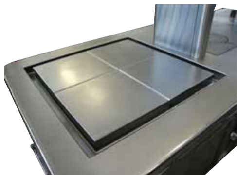
2 x double 'Plaque Athador' Plancha