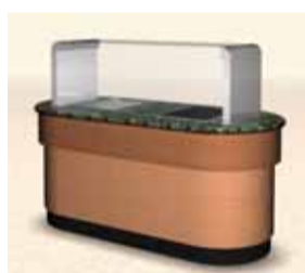
King's Buffets 'Show Cooking'