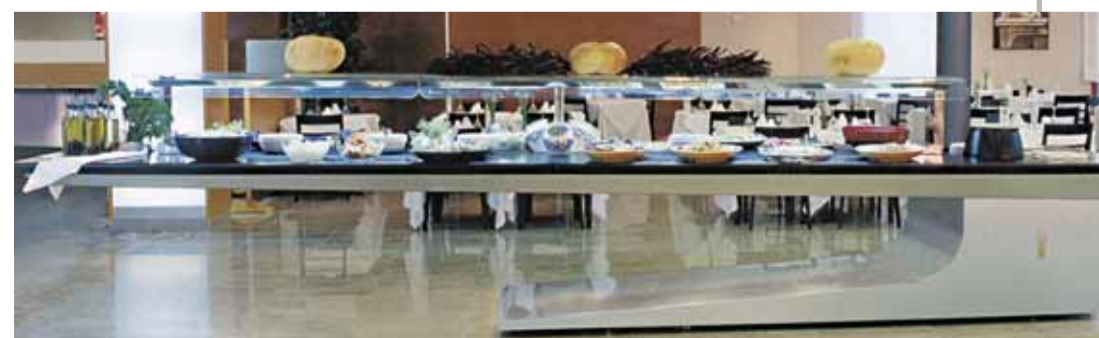
King's Buffets 'Design State' buffet table

"Flexibility of the equipment was required" says Alan Hill, Director of Food & Beverage, "we needed a central buffet arrangement for the busy breakfast period, which could then be easily converted for lunch and evening service."