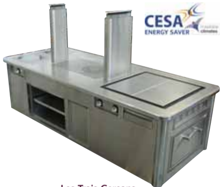
Les Trois Garçons Athador bespoke cooking suite

The Athador team have in excess of 80 years experience in building Bespoke Cooking Suites. They bring to the market the traditional power and performance of a Bespoke Cooking Suite, with the use of 21st Century components and materials to ensure the product can perform and withstand the rigors of the harshest of kitchen environments.